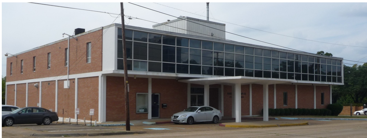
Figure 1 - Current Board Office Location